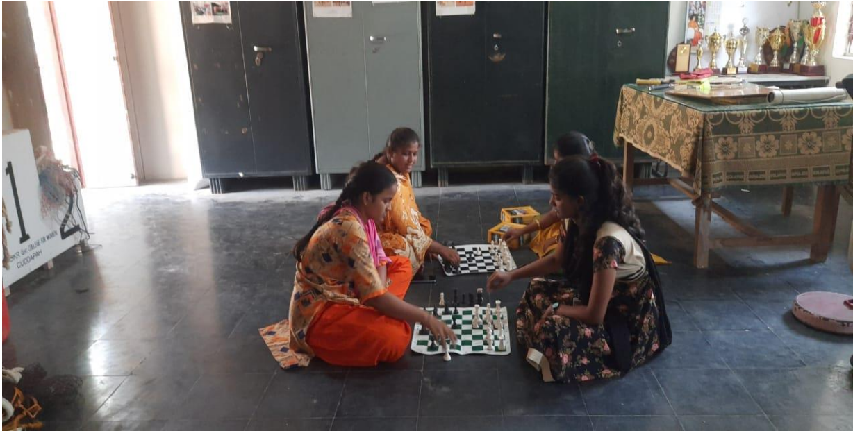
Game of Chess